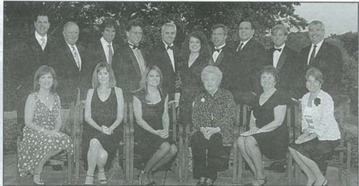
2006 Gala of Hope Committee

The salon is located at 7950 Jericho Turnpike, Woodbury. For more information, please call 496-8180.